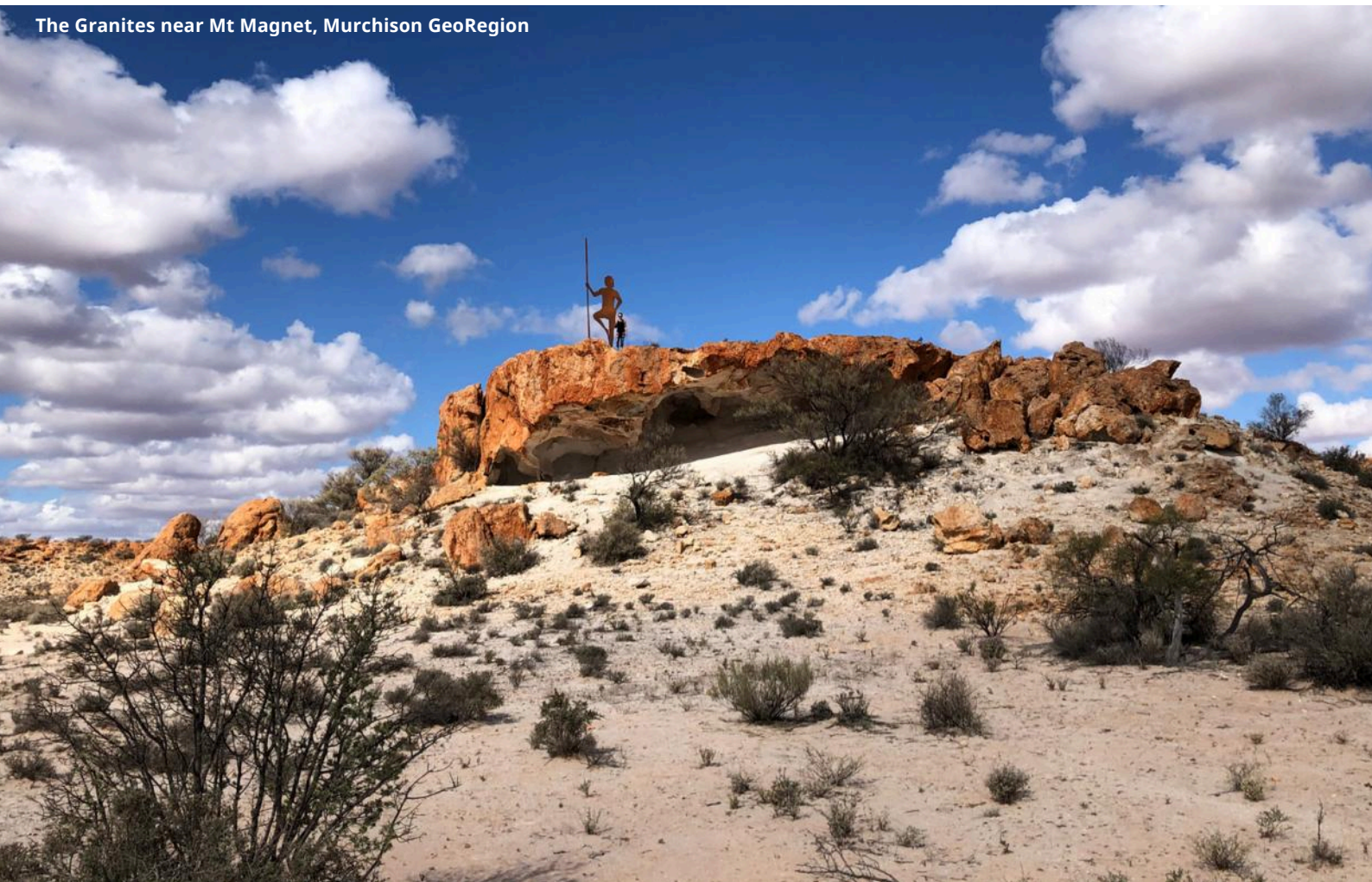
The Granites near Mt Magnet, Murchison GeoRegion

Celebrating WA's internationally-recognised dark skies