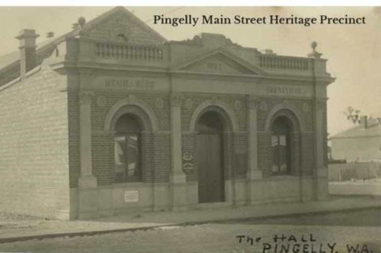
Pingelly Main Street Heritage Precinct