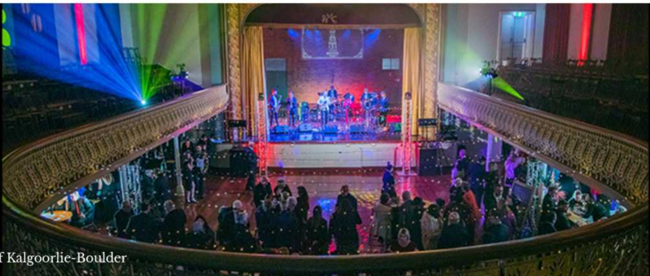
City of Kalgoorlie-Boulder

Celebrating Western Australia's unique cultural heritage