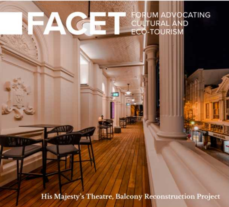
His Majesty's Theatre, Balcony Reconstruction Project