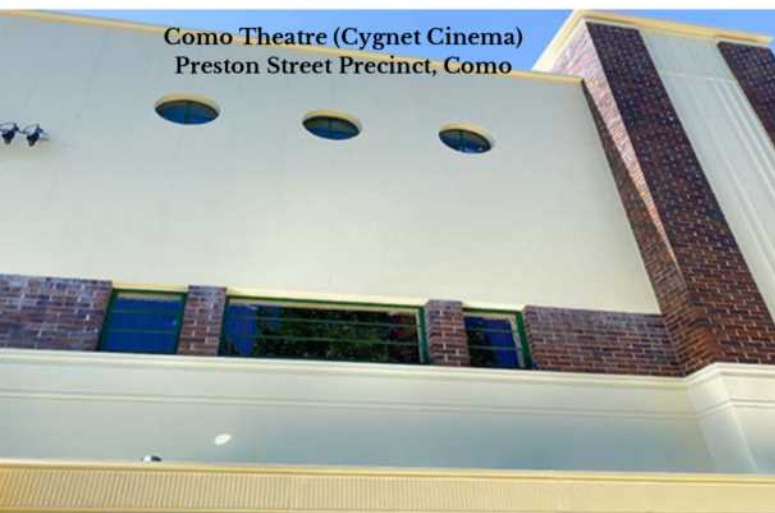
Como Theatre (Cygnet Cinema) Preston Street Precinct, Como