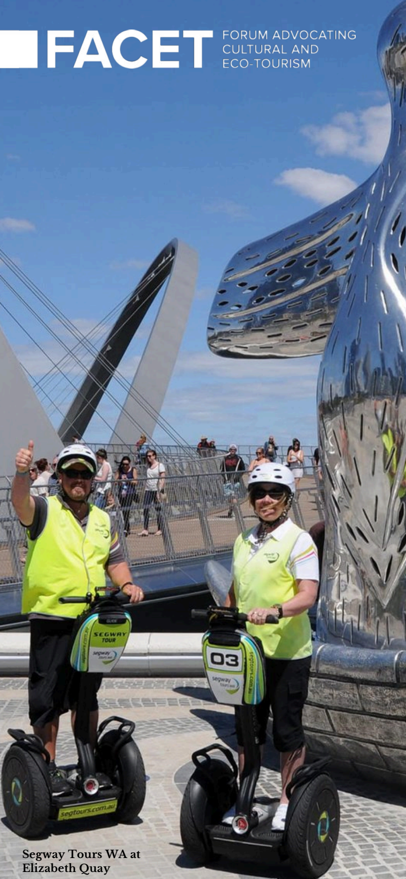
Segway Tours WA at Elizabeth Quay