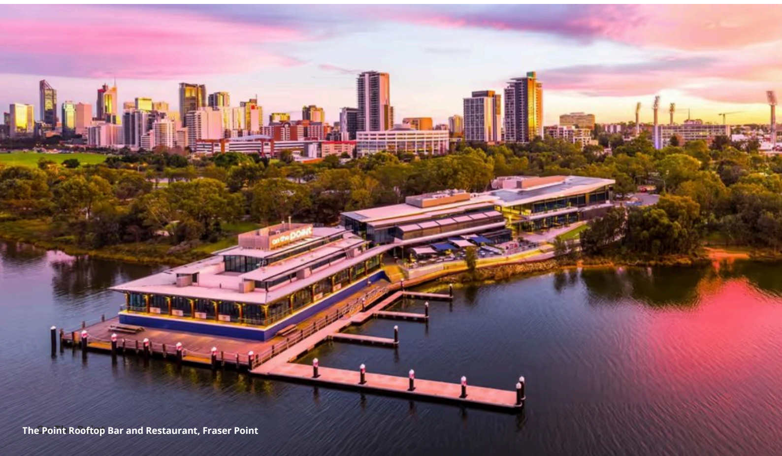
The Point Rooftop Bar and Restaurant, Fraser Point